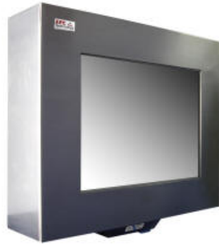
FT2255 15" Panel PC