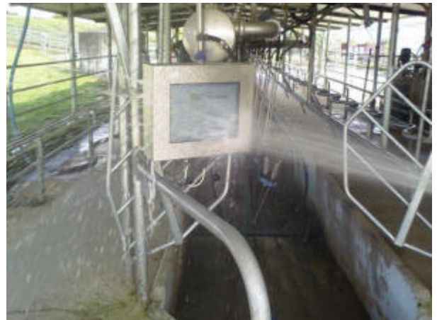
Real life application of FT Unit